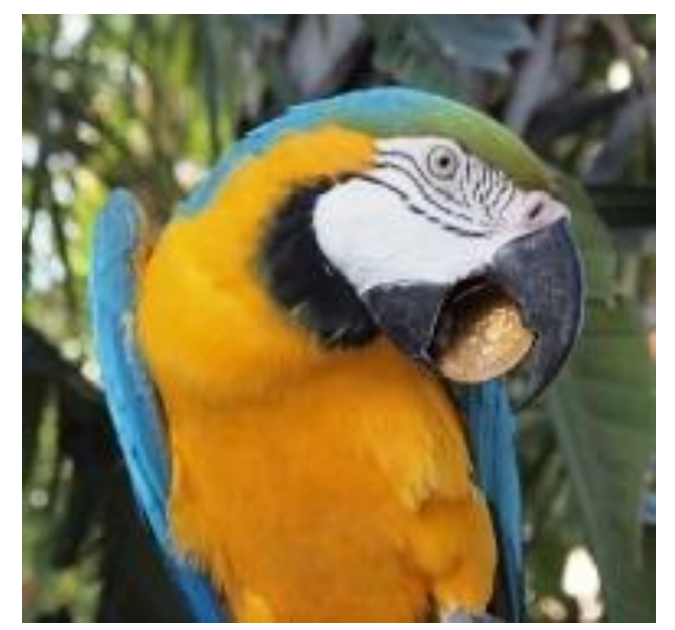
Club Coin Clues will be posted on the Website

https://theringfinders.com/blog/Suncoast.Research.Recovery.Club